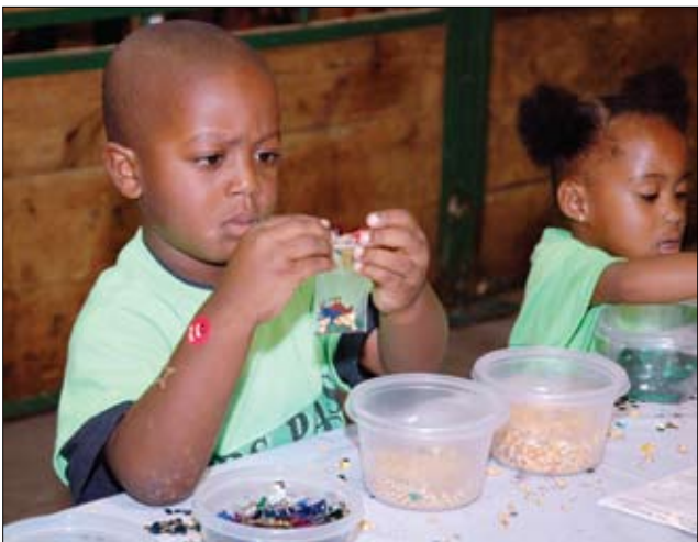
New this year was Michigan Farm Bureau's booth where youngsters got to make a "farm charm" representing the different elements needed to farm.