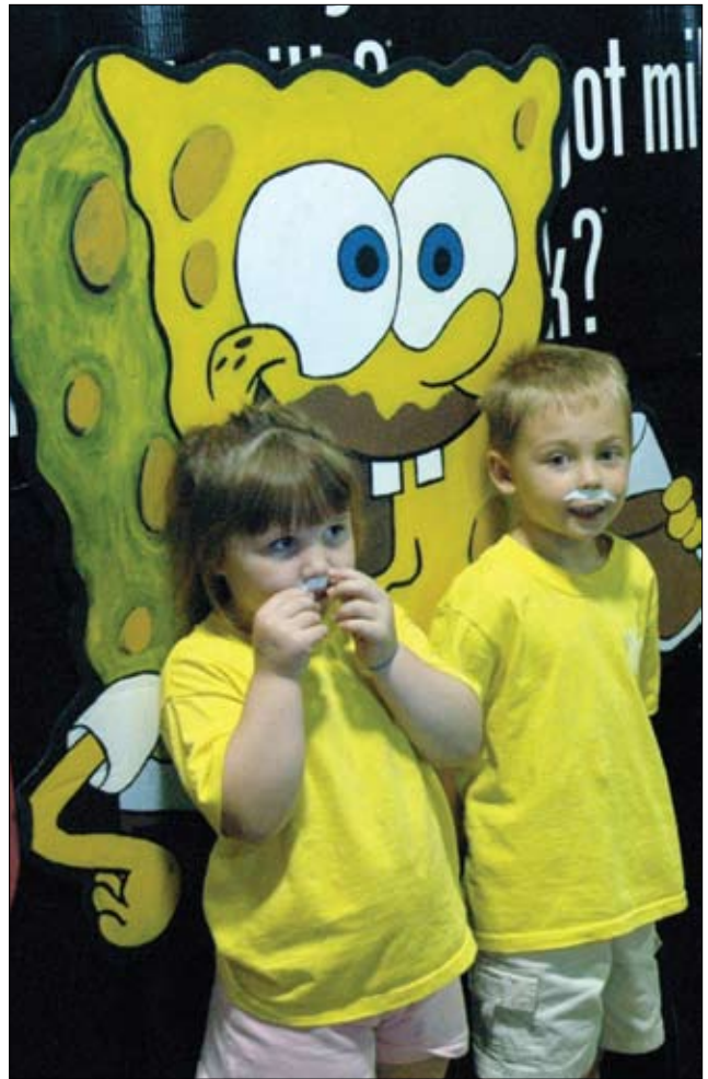
Even with all the new exhibits, milk mustache photos remained one of the most popular activities at the Great Dairy Adventure.