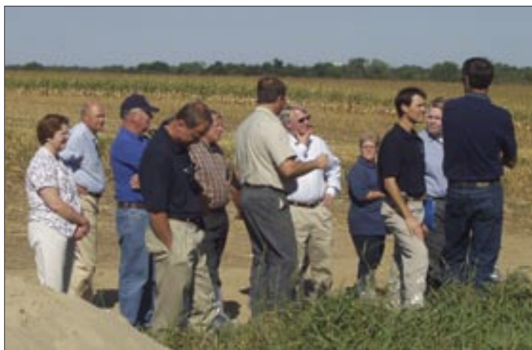
The group also toured the farm's manure lagoon areas.